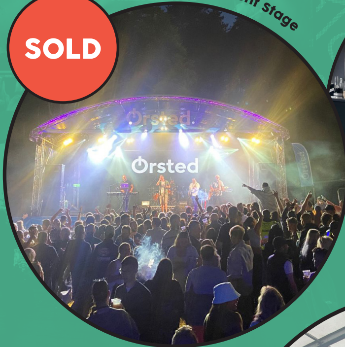
Live Entertainment stage