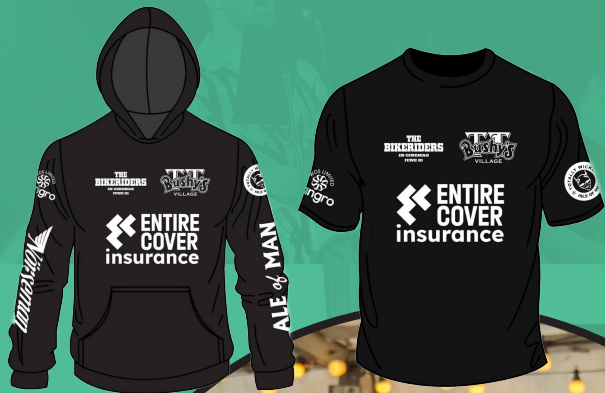
Staff T-shirts and hoodies